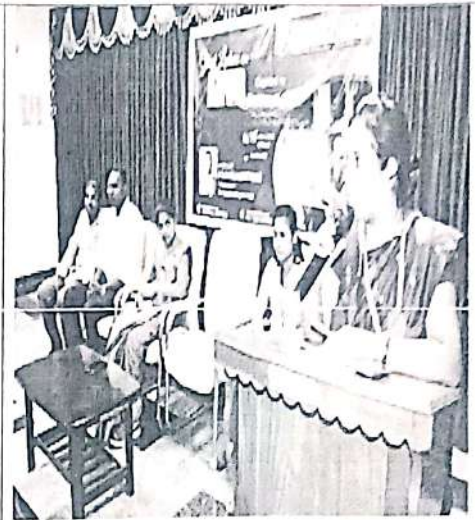
Poster sample & Collage Photo