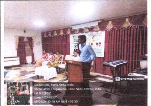
Poster sample & Collage Photo